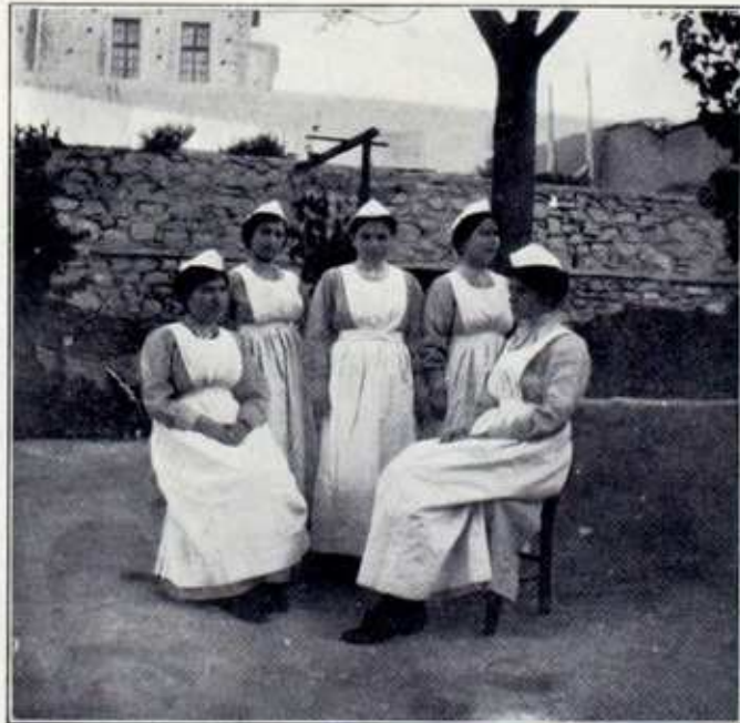
GROUP OF NURSES

This year we have had no graduating class, and our force of nurses has included two former graduates. The service required has been more exacting than ever before; indeed, we find that the type of nursing and care demanded for our patients here is on a higher scale than that to which we were accustomed further in the interior. We have had foreigners as private patients, German, English, etc., maternity cases, who expect up-to-date appointments and care, as in a hospital abroad. These cases pay well, but require an amount of extra time and labor that has been hardly paid for, and when we are crowded it would be impossible to undertake them. The two nurses who will graduate next year are good material and have been having most efficient training from Miss Cushman. She has taken entire charge of the nursing and training of the nurses this year, in addition to the general management, and the smoothness and efficiency of the working has shown how she has given herself to it. The difficulty of leaving the Training Class unprovided for makes it hard for her to get away for her furlough, which is now due. What arrangements can be made for this purpose is not at all clear.