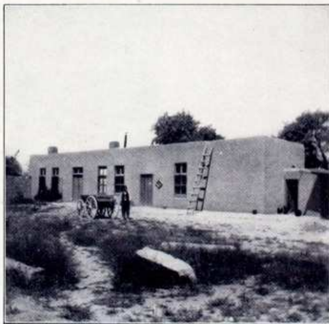
HOUSE FOR GARDENER AND WATCHMAN